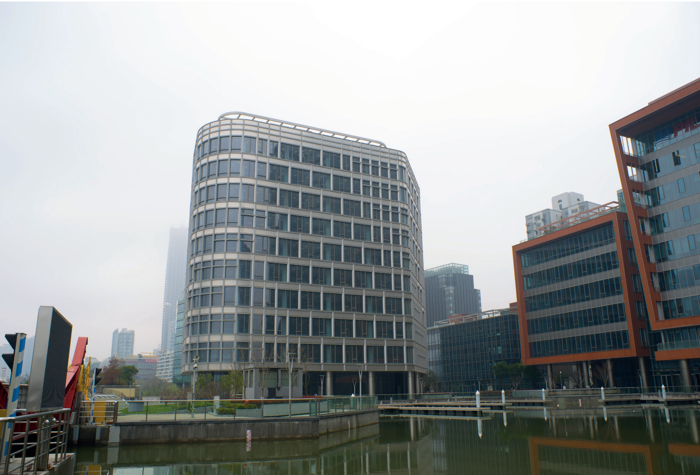
Figure 1 Harbour side view of Building 17, 17号楼港口侧外观

位于黄浦江畔的上海国际航运服务中心（SISSC）项目，致力于在国内树立绿色、低碳、智能及高效建筑的新标杆。为在中国市场实现这些目标，该项目率先在中国使用了英国建筑研究院环境评估方法BREEAM 1 ，这项世界级领先的建筑设计评估方法。在这个开发项目中包含了达到了中国第一个同时完成BREEAM设计和竣工阶段认证的建筑物。17号办公楼，由双塔组成共13层（含地下3层），总建筑面积约25,000平方米（见图1和图2），达到了BREEAM设计阶段“很好”（三星级），以及竣工阶段“优秀”（四星级）。本文概述了BREEAM如何提高了17号楼可持续发展的益处和价值。