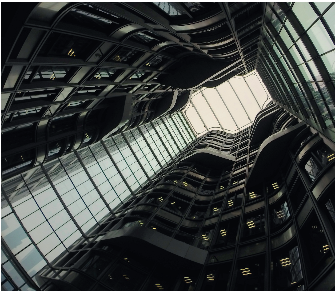
Figure 2 Atrium of building 17 17号楼中庭

The BREEAM principles and methodology align closely with the Chinese Government's policy for green buildings, which promotes sustainability through the efficient use of energy, water, land and materials. Using BREEAM as a design tool, Building 17 has been designed and built to high sustainability performance levels that go beyond current Shanghai and Chinese standards and practices, and has involved the use of a number of state-of-the-art technologies, features and processes. Consequently, Building 17 has achieved the highly regarded BREEAM 'Excellent' rating at the post construction assessment stage, representing performance equivalent to that of the top 10% of new buildings internationally. The following points highlight some examples of where Building 17 has demonstrated best practice in terms of the BREEAM performance requirements and therefore exceeded current Chinese standards.